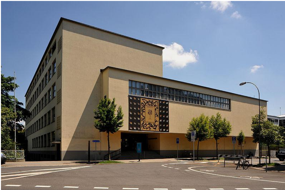
Natural History Museum of Bern, Switzerland (Please be aware that there is no parking place available at the museum).